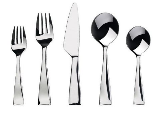
Figure 3 Stainless Steel Cutlery

Stainless steel cutlery is almost environmentally friendly, and economically feasible, and socially acceptable. Harry Brearley invented stainless steels in Sheffield England in the 1912 when he was looking for corrosion-resistance alloy for gun barrels.