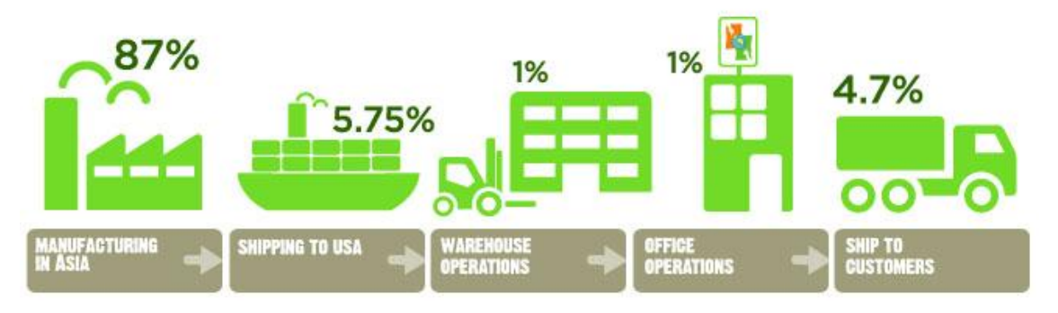
Figure 2 World Centric carbon footprint

World Centric has strived to offset carbon emissions from production to transportation. For example, a combination of wind and solar renewable energy system has been installed in their office. They also reimburse public transportation cost for their stuff. In addition, cooperated with other organization, they planned to plant 176,824 trees to offset carbon emission.