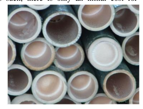
Figure 6 Harvested Bamboo

clear-cutting an area to reserve specifically for the planting of bamboo. Harvesting the bamboo itself can be quite a dangerous process, as they tend to grow up to several hundred feet in height. As such, proper training will be required before being able to cut down these trees. Initially, the first bamboo stalk